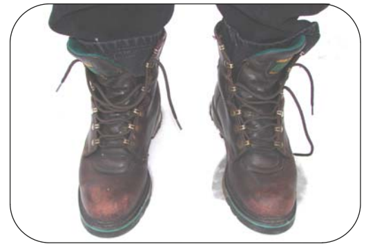
Figure 2. Try walking in unlaced boots to simulate the laxity of the pedal bone within a claw.

Neither producers nor their advisors can halt the parturition effect on claws. However, they need to understand the effect and find ways to minimize contusions during the period of laxity of the pedal bone within the claw. Let's start by unlacing our work boots and walking routes taken by our cows in their workplace. Make it a parade of veterinarians, producers, contractors, designers, engineers, and nutritionists. To find hazards, it's best to experience pressure on feet in sloppy-fitting boots while stepping up or down, turning 90 degree corners in parlors, pushing for feed, fleeing a boss cow or bull, lurching from an injection, jumping a gutter, stepping out of a stall, or slipping on a floor. Parade routes should include several types of barns, various marching speeds, and happen over several days or weeks. Debriefings should include findings and recommendations from each sloppy-booted participant/expert. From our findings, we should take action. We need to use new research information to educate about predisposing causes of lameness, to design and to build claw-friendly barns. For the benefit of Ontario's cows, let's unlace our boots, head for the barn, and take the first steps.