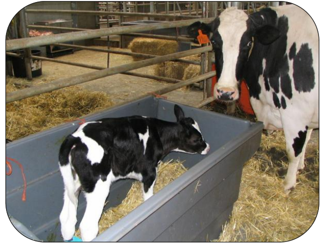
Figure 1. Pictures showing the feed trolley being used to separate calves from cows.

Selman, et al. (1) . Probably of greater importance was the difference in quantity of colostrum fed. Selman, et al. (1) fed 2.5 L of colostrum (IgG 68g/L) to a 45-kg calf, whereas we fed 3.8 L of higher quality (89.5 g IgG/L) colostrum. Perhaps the influence of the mother only occurs at lower immunoglobulin intakes.